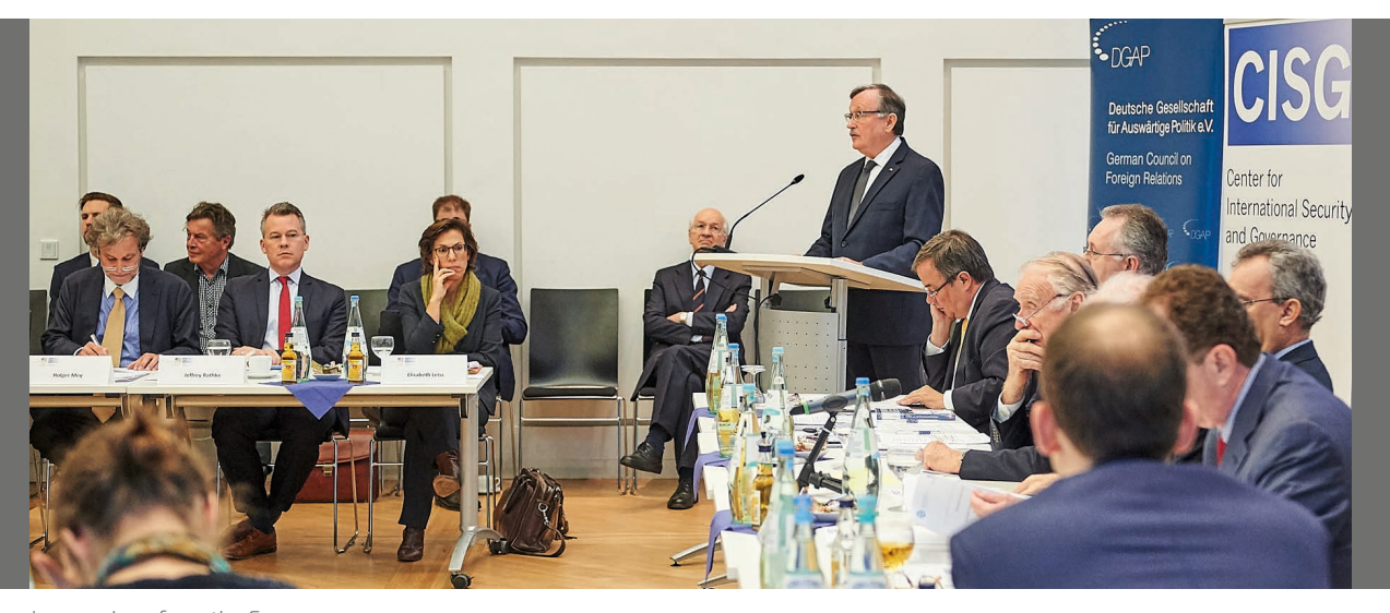
Impressions from the Forum

A related issue is a familiar tension between national and European interests and politics that decisionmakers inevitably face. While public support for greater European cooperation on security suggests that voters would likely support policy advances, spending for costly investments needed to enhance capabilities will clash with other domestic priorities. Budget reallocations are most likely to be far less popular measures, particularly in times of social and economic uncertainty, and European politicians are likely to fear losing voter support over substantial defense budget increases. As such, there is a risk that the current boom in talk of European defense and security could remain a mostly rhetorical phenomenon. A failure to build on existing support for joint European security mechanisms, however, could spark further disillusionment with European affairs and trigger a major loss of political capital.