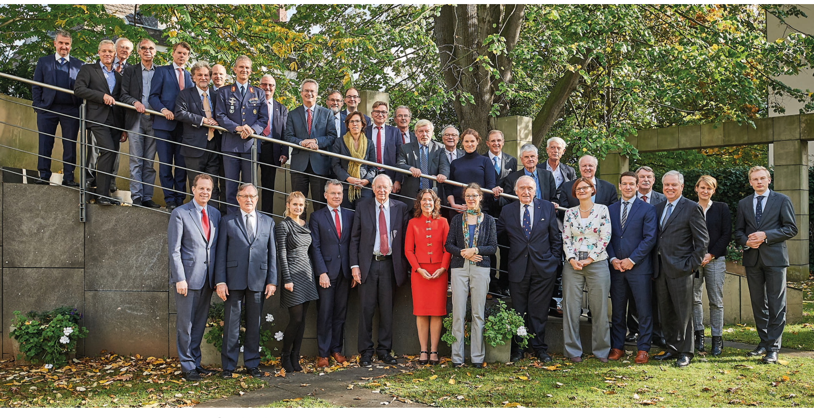
Participants of the 2017 Security Forum

NATO. Other proposals on NATO burdensharing proved to be more controversial. Above all, the Wales Summit agreement on the 2 percent defense spending target remains a point of contention between Europe and the U.S. While Americans underlined that the call for higher European defense spending is near-ubiquitous among U.S. policymakers, Europeans suggested that the American leadership should perhaps adopt a more differentiated understanding of defense spending, including funds spent on development and nation building.