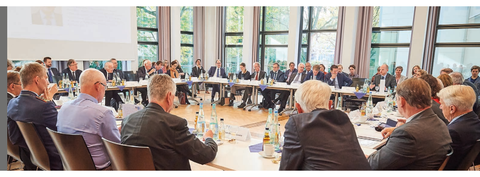
The 2017 Bonn Security Forum in progress

Skeptics proposed, however, that continued overdependence on U.S. engagement might prove to be the current system's fatal weakness. A lack of American support in rhetoric and practice for liberal multilateralism could strengthen those opponents of the tenets of the liberal world order who prefer an international structure marked by unilateralism and competition for influence in a multipolar world. The time available for safeguarding the current global order might be limited and the current state of uncertainty a mere calm before the storm, forcing those countries that benefit the most from a rules-based liberal system, among those Germany, to swiftly adjust their international engagement to a transforming environment. The international community has, in fact, experienced an unprecedented series of challenges in recent years, from the Ukraine crisis to escalating tensions in North Korea or the ongoing humanitarian and security crisis in Syria. Perhaps the current state of the liberal world order could best be likened to a cracked windshield in a moving car: while the resilience of the glass is a testament to the quality of its design, one major blow to its structure could suffice to cause a disaster.