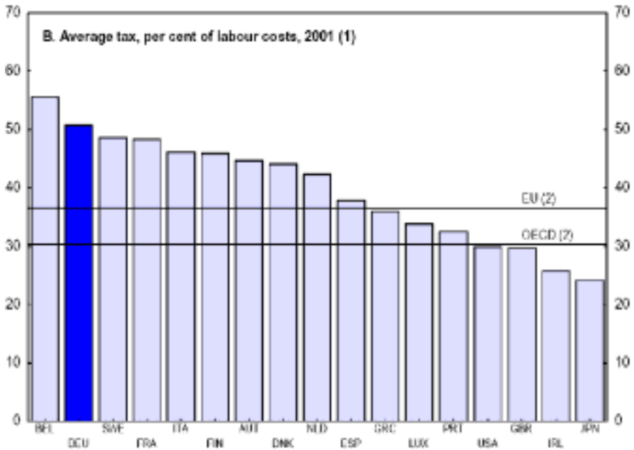
Figure 3 The “Wage Wedge” in Comparative Perspective

What has produced such a large wage wedge in Germany? The rising costs of financing retirement and unemployment. In 1972, the German government spent €6.8 billion, or 12.4 percent of its federal budget, on pension costs. By 2002, pension expenditures had risen to €49.3 billion, or 29.1 percent of the German federal budget. In 1970, an employer and employee paid a total of 11.1 percent of earnings to fund the pensions of retirees. By 1990, the total contribution to fund pensions had risen to 15 percent as a result of declining birth rates and rising life spans. The government of Helmut Kohl decided to fund many of the expenses of German unification through the pension and unemployment systems. This enabled it to reduce the size of the immediate tax burden imposed by German unification, but it came at the price of expanding the German